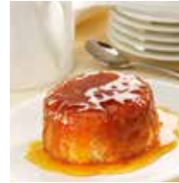
Gluten Free Syrup Sponge

A family favourite! Lashings of golden syrup cascading over a melt in the mouth light gluten free syrup sponge pudding.