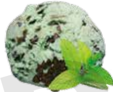
Mint Choc Chip

A delightful dairy ice cream with strawberry pieces to give a taste of summer all year round.