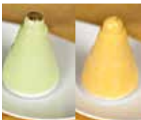
Mango and Pistachio Kulfi

Indian ice cream, specially prepared using exotic ingredients to give its unique flavour.