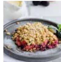
Hot Apple Crumble and Blackberry

Apple & Blackberry compote topped with a golden crunchy crumble.