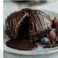
Chocolate Melt in the Middle

Light chocolate sponge filled with a rich chocolate fudge sauce, topped with Belgian Chocolate.