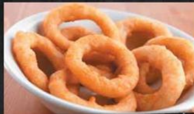
Onion Rings V £1.60