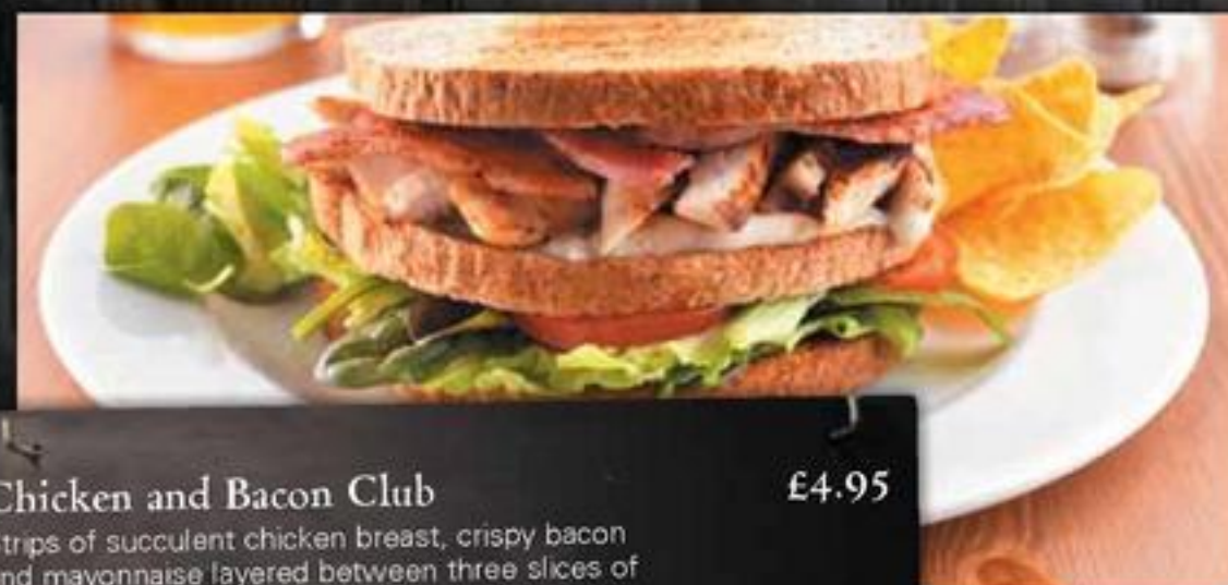
Chicken and Bacon Club