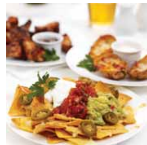
BBQ Chicken Wings; Classic Nachos Sharer; Crispy Potato Skins

Classic Combo Sharer £8.45 Southern-fried-style chicken fillets, beer-battered onion rings, tortilla chips, garlic bread and cheese & bacon potato skins, served with sour cream and a sweet chilli dip.