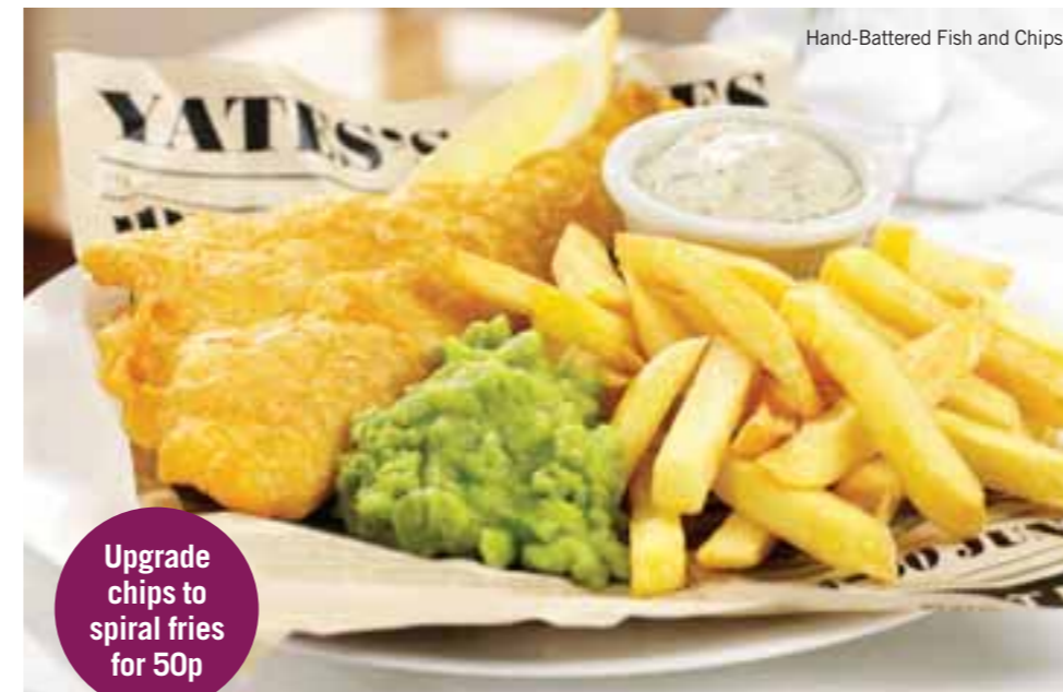
Hand-Battered Fish and Chips

British Steak & Bombardier Pie £6.25 Tender pieces of beef in a rich ale gravy, encased in shortcrust pastry, served with mashed potato, peas, carrots and gravy.