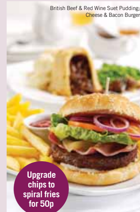
British Beef & Red Wine Suet Pudding; Cheese & Bacon Burger

Hot Chicken & Bacon Salad £5.85 Served on a bed of mixed leaves, tomato, cucumber, coriander and red onion, with a lime & chilli dressing.