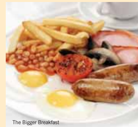
The Bigger Breakfast

Bacon Sandwich £1.49 Choose white or wholemeal bread.