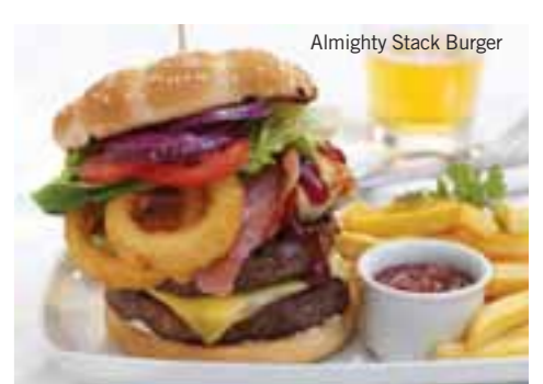
Almighty Stack Burger

One of our classic 6oz beef, southern-fried-style chicken or vegetable burgers, served in a seeded bun, with mayonnaise, a side of relish and chips – and a drink 1 .