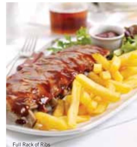
Full Rack of Ribs

Full Rack of Ribs £7.45 Tender ribs topped with either smoky or spicy BBQ sauce, served with chips and a dressed leaf garnish.