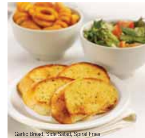
Garlic Bread; Side Salad; Spiral Fries