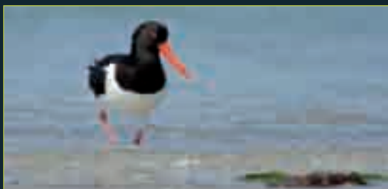
Answers: Grey Seal Pup, Puffin, Eriskey Pony and foal, Golden Eagle, Red Deer and Oyster Catcher